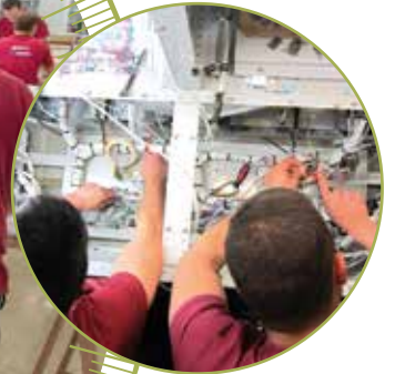
ON BOARD ASSEMBLY