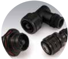
HIGH POWER CONNECTORS