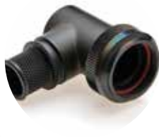
BLACK ZINC NICKEL SOLUTIONS